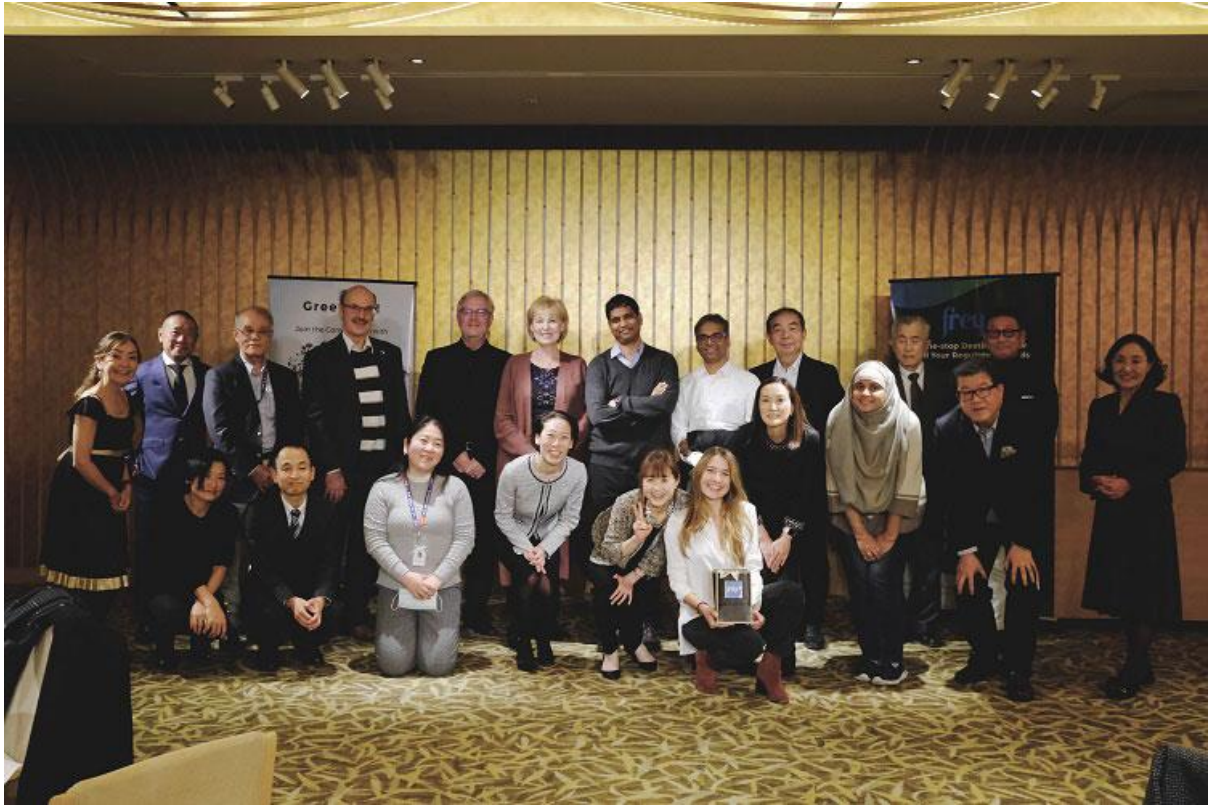
Freyr Japan Team

To assist with establishing Freyr Solutions' Japanese subsidiary ( Freyr Life Sciences KK ), JETRO Invest Japan Business Support Center (IBSC) provided market information, regulatory and institutional information, and PR support. IBSC also plans to provide real estate information and other support for the expansion of the company's bases in Japan in the future.