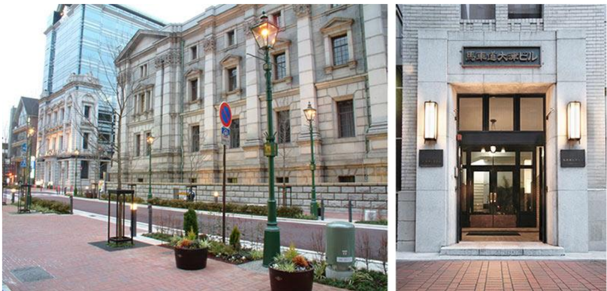
Freyr Japan Locations

To assist with establishing Freyr Solutions' Japanese subsidiary ( Freyr Life Sciences KK ), JETRO Invest Japan Business Support Center (IBSC) provided market information, regulatory and institutional information, and PR support. IBSC also plans to provide real estate information and other support for the expansion of the company's bases in Japan in the future.